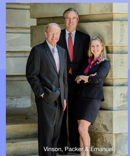
Vinson, Packer & Emanuel